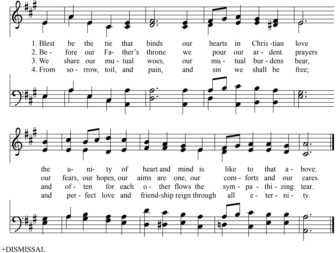
+DISMISSAL ONE: Go in peace, together in Jesus' love. MANY: Thanks be to God!