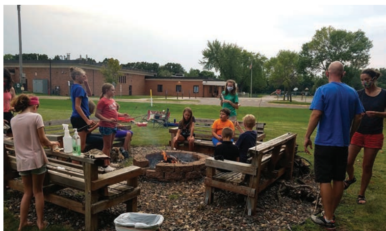
Near the end of August, Peace gathered around the campfire to sing songs, tell stories, and roast s'mores.