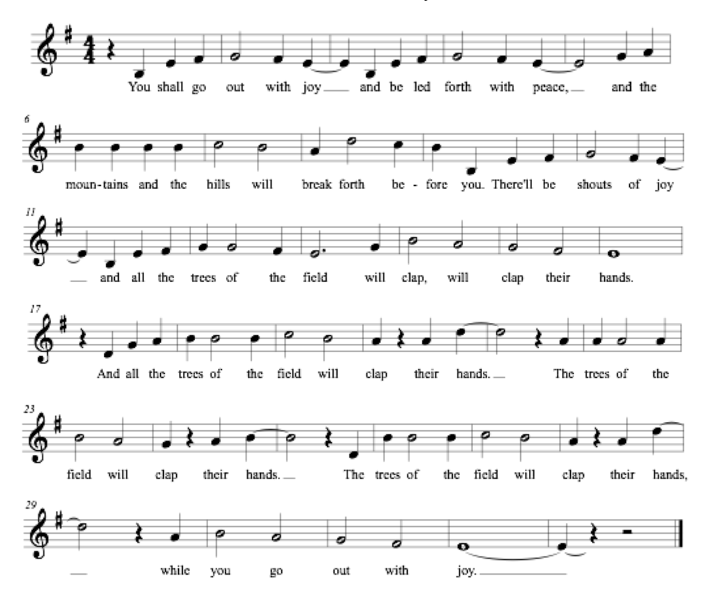
DISMISSAL Kjell- ONE: Go in Peace, serve the Lord. MANY: Thanks be to God!