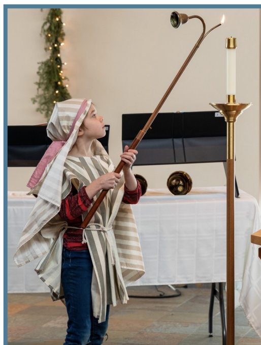
2018 Christmas Pageant