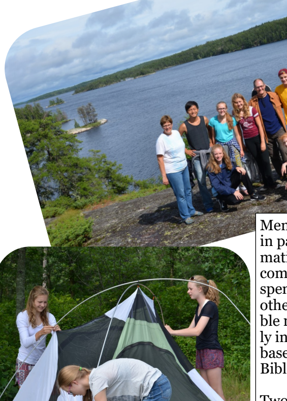
Page 1: More photos from the Senior High Houseboat trip!

Men and women, boys and girls of all ages are encouraged to join together in pairs as "Bible Buddies" this year. Through these pairs, the Faith Formation Team hopes to help develop relationships between age groups. Becoming a Bible Buddy means adults, teens and pre-teens will commit to spending 15 minutes each Wednesday and Sunday checking in with each other: sharing day-to-day joys and concerns and discussing our weekly Bible readings. On Wednesday nights, Older Buddies will be able to dig deeply into Bible texts, then engage Younger Buddies in hands-on, activity-based learning. We hope that every member of the congregation will have a Bible Buddy by the time we get to Welcome Sunday on September 11.